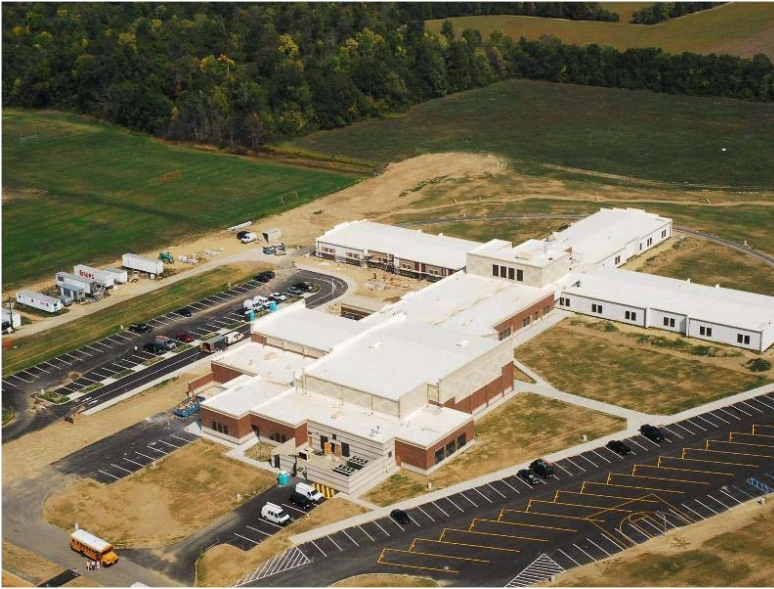
Trotwood Middle School

Bruns General Contracting 3050 Tipp-Cowlesville Rd. Tipp City, Ohio 45371